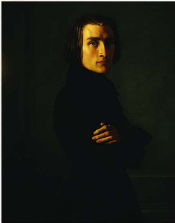
Portrait of Franz Liszt , 1838. Henri Lehmann. Musée Carnavalet, Paris, France.

remarkable in his appearance. Swathed about his forehead, and hanging down over his face, so low as to be shaken by his breath, Mr. Hooper had on a black veil. On a nearer view, it seemed to consist of two folds of crape, 2 which entirely concealed his features, except the mouth and chin, but probably did not intercept his sight, farther than to give a darkened aspect to all living and inanimate things. With this gloomy shade before him, good Mr. Hooper walked onward, at a slow and quiet pace, stooping somewhat and looking on the ground, as is customary with abstracted 3 men, yet nodding kindly to those of his parishioners who still waited on the meetinghouse steps. But so wonder-struck were they, that his greeting hardly met with a return.