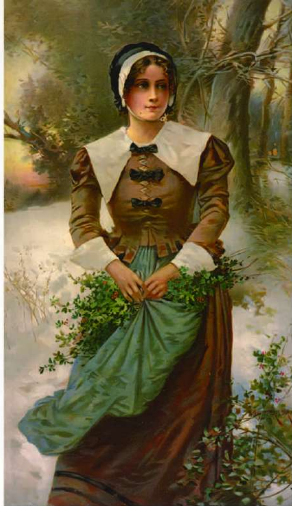
A Fair Puritan , 1897. E. Percy Moran.

26 "No," said she aloud, and smiling, "there is nothing terrible in this piece of crape, except that it hides a face which I am always glad to look upon. Come, good sir, let the sun shine from behind the cloud. First lay aside your black veil: Then tell me why you put it on."