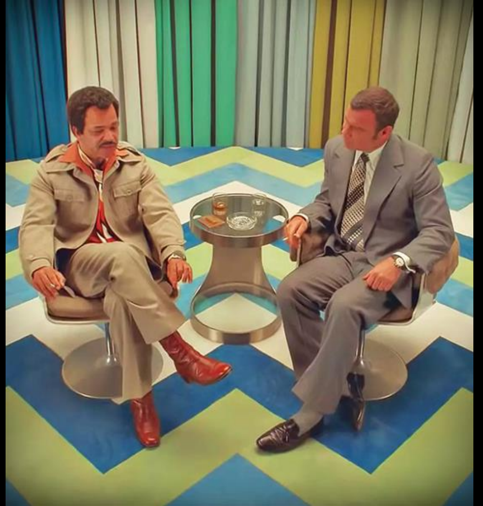
The French Dispatch (2021)

2. The goal of cinematic language is to effectively convey stories, emotions, and ideas through the use of visual and audio elements. It aims to create a unique and immersive experience for the audience, employing techniques such as camera angles, editing, lighting, sound design, and narrative structure to communicate and evoke specific responses.