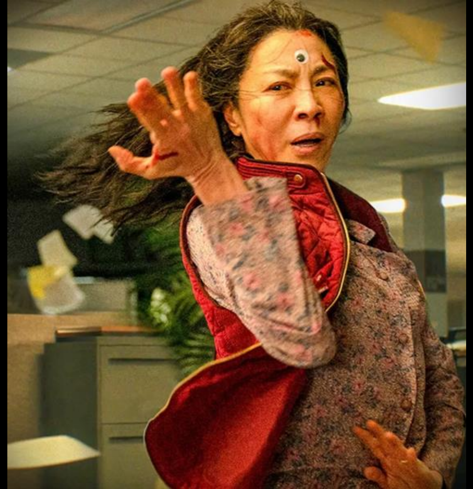
Everything Everywhere All at Once (2022)