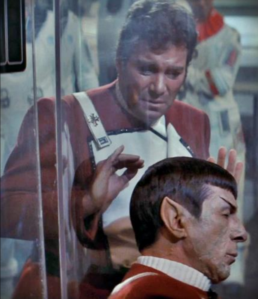
Star Trek II - The Wrath of Khan (1982)