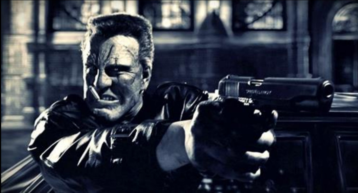
Sin City (2005)