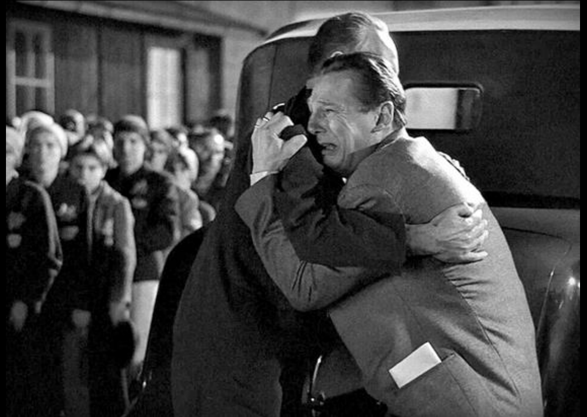
Schindler's List (1993)