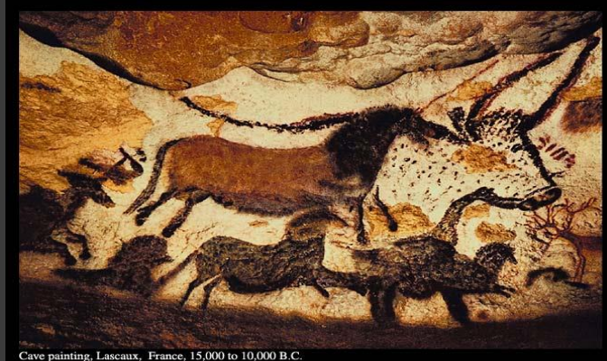
Cave painting, Lascaux, France, 15,000 to 10,000 B.C.

Cave paintings, from 20,000 years ago, are among the oldest forms of human expression and could be either a record of what prehistoric man hunted (non-fiction), or alternately a story expressing what they would like to catch (fiction).